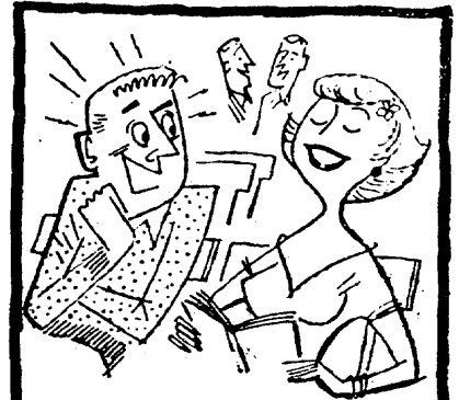
WILBUR JUST WOKE UP TO THE FACT THAT HE'S IN CLASS!