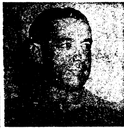
Prof. Nat Holman Hopes For Win, But . . .